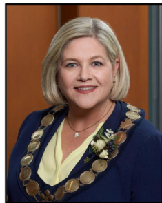
Mayor, City of Hamilton